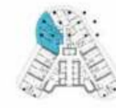
LEVELS: 5,6,11,12,17,18, 23,24,29,30,35,36,41,42