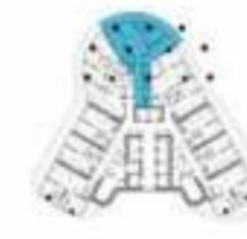
LEVELS: 5,6,11,12,17,18, 23,24,29,30,35,36,41,42