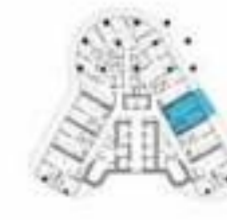
LEVELS: 5,6,11,12,17,18, 23,24,29,30,35,36,41,42