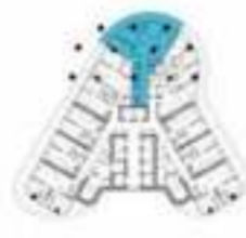
LEVELS: 3,8,9,14,15,20, 26,27,32,33,38,39