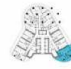
LEVELS: 5,6,11,12,17,18, 23,24,29,30,35,36,41,42