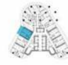
LEVELS: 5,6,11,12,17,18, 23,24,29,30,35,36,41,42