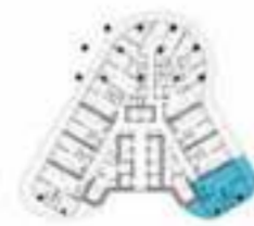
LEVELS: 3, 8, 9, 14, 15, 20, 26, 27, 32, 33, 38, 39