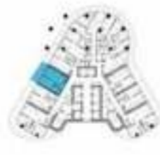
LEVELS: 3,8,9,14,15,20, 26,27,32,33,38,39