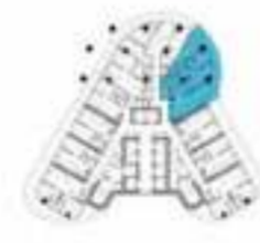
LEVELS: 3,8,9,14,15,20, 26,27,32,33,38,39