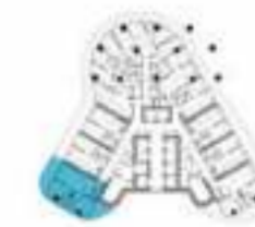
LEVELS: 5,6,11,12,17,18, 23,24,29,30,35,36,41,42