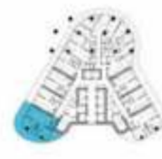
LEVELS: 3,8,9,14,15,20, 26,27,32,33,38,39