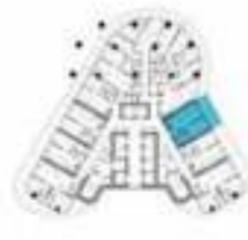
LEVELS: 3,8,9,14,15,20, 26,27,32,33,38,39