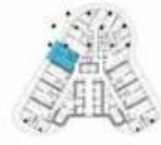
LEVELS: 3,8,9,14,15,20, 26,27,32,33,38,39