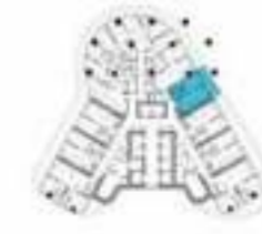
LEVELS: 5,6,11,12,17,18, 23,24,29,30,35,36,41,42