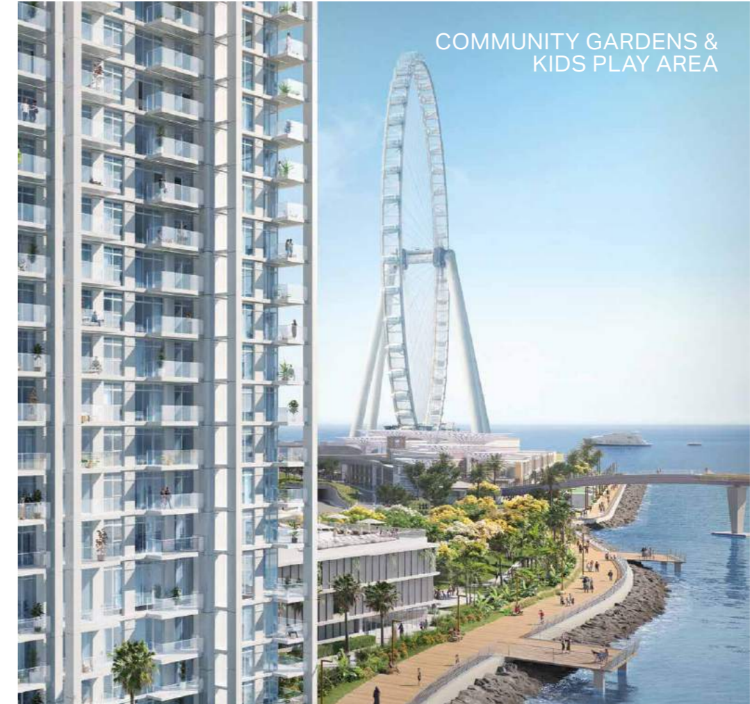
COMMUNITY GARDENS & KIDS PLAY AREA